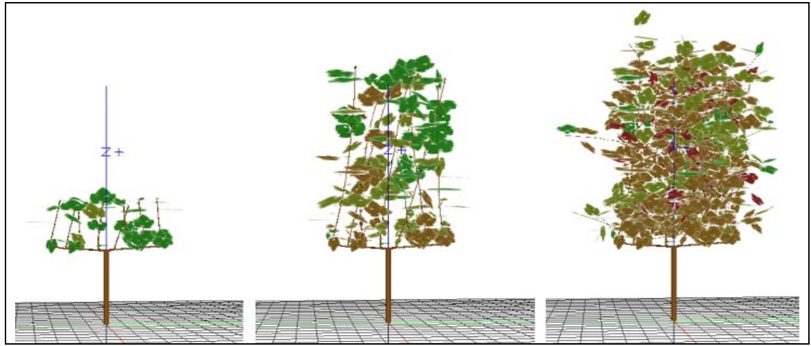
Fig. 1 : Visualization of vine stock on year 1998, at days 133, 168 and 241 using the PlantGL module from OpenAlea.

Moreover, a friendly user interface has just been devised to facilitate numerical simulations of the model (written in Python-C languages), and to facilitate the investigation of the spatial distribution of the disease (Figure 2).