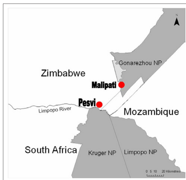
FIGURE 1: The location of the two communal areas (Malipati and Pesvi) that were surveyed in the Chiredzi district in Zimbabwe that borders the Gonarezhou National Park and the Kruger National Park.

Only milk ( n = 10 ) and blood samples ( n = 18 ) collected from animals which had a history of abortion and had tested