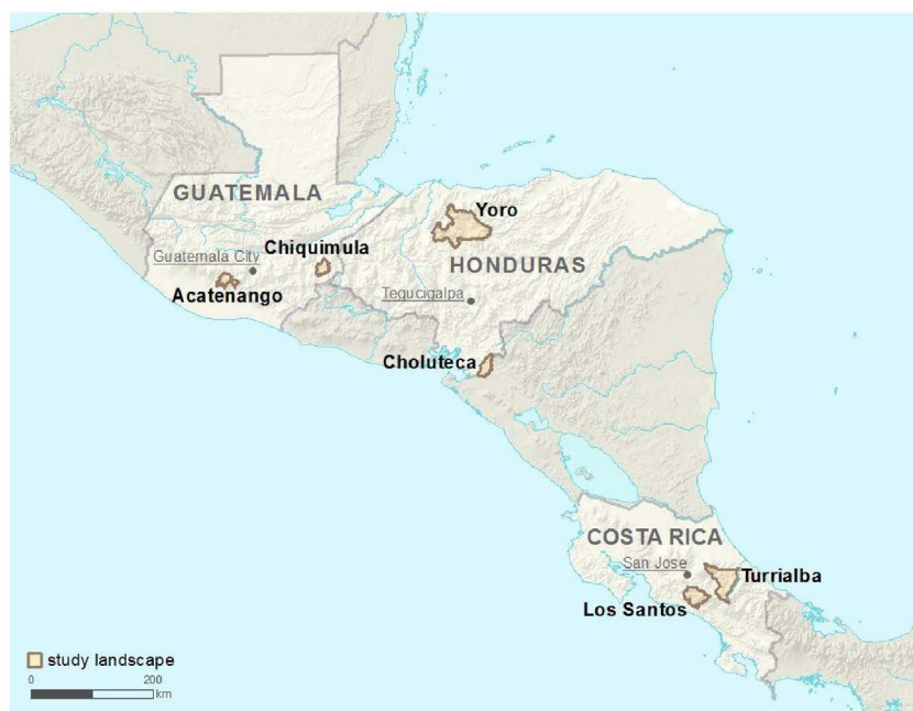
Fig. 1. Location of six agricultural landscapes in Central America in which the use of EbA practices by smallholder farmers was characterized.

sample size was 300 farms (50 per landscape X 6 landscapes).