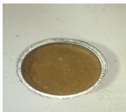
Fig. 2b. M. oleifera powder leaves fermented