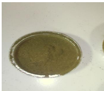
Fig. 2a. M. oleifera powder leaves unfermented

The fermentation of M. oleifera powder leaves is possible to increase the protein product due to increase of biomass; increasing the reducing sugar content due to the hydrolysis of complex sugars and phenolic compounds. Indeed phenolic compounds are abundant in the young stages of development of plants [16]; they reduce the onset of maturation and then become stable [17].