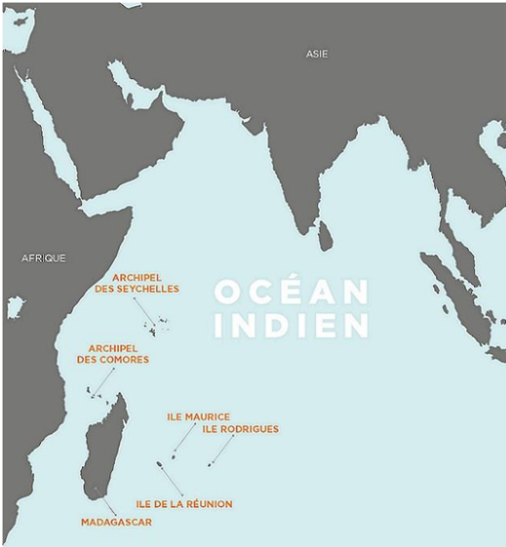
Figure 1: Map of the Indian Ocean and countries part of the IOC, IOC annual report 2014 (French)