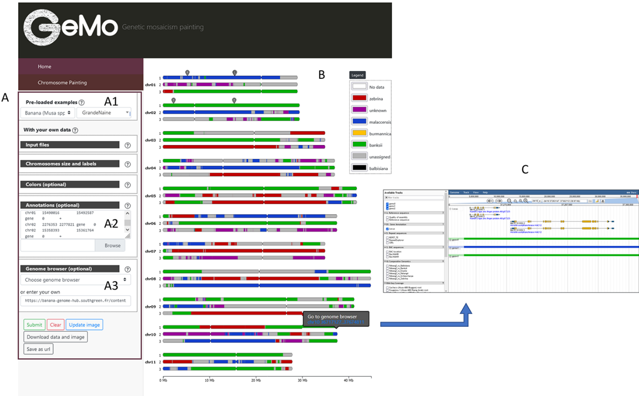
Figure 1. Overview of the GeMo visualization interface representing the genome ancestry mosaics of the triploid cultivated banana ‘Grande Naine’ (13). (A) Menu panel allowing the user to load their own data or to visualize preloaded data (A1). (B) Predicted mosaic structure for the 3 × 11 chromosomes as proposed in (13). Each color on the chromosomes represents a genetic group, except dark gray for undefined genomic block. Symbols on chr01 and chr02 indicate genomic features (such as gene of interest, QTLs, etc.) entered by users based on genomic coordinates of the reference genome used to draw the genome ancestry mosaics in the menu entitled ‘Annotations’ in A2. (C) Automatically exported dataset from GeMo by clicking on a block and imported as a track to the JBrowse configured in the Genome Browser menu in A3.