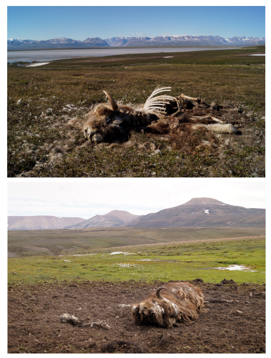
Figure 3. Pictures of carcasses found in July 2016 in the lower Schuchert Dal valley (top) and the Colorado Dal valley (bottom).

calf percentage if sustained over several years would cause population decline. Further, our low calf productivity indicates possible fecundity or nutritional problems.