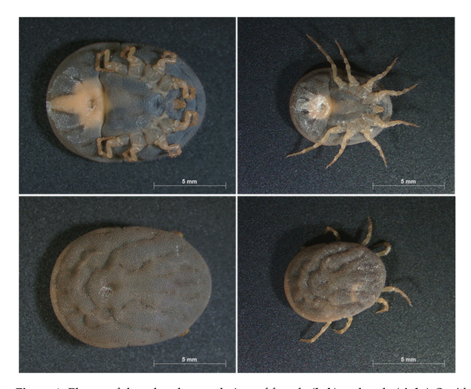
Figure 1. Photos of dorsal and ventral view of female ( left ) and male ( right ) Ornithodoros moubata (Source: F. Taraveau). Ticks are from the Neuchâtel strain (University of Neuchâtel, Switzerland), maintained at the insectarium from CIRAD (Montpellier, France) since 2008.

Ornithodoros soft ticks, also known as tampans, are the only known arthropod biological vectors of ASFV, and they are morphologically and biologically different from hard ticks (Figure 1).