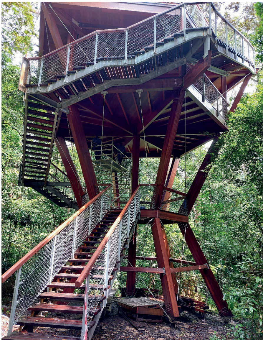
Treetop classroom made of padouk, Raponda Walker Arboretum, Cap Estérias, Gabon Ecwood production

https://www.gabonreview.com/arc-demeraude-une-salle-de-classe-perchee-dans-les-arbres-a-larboretum-raponda-walker/