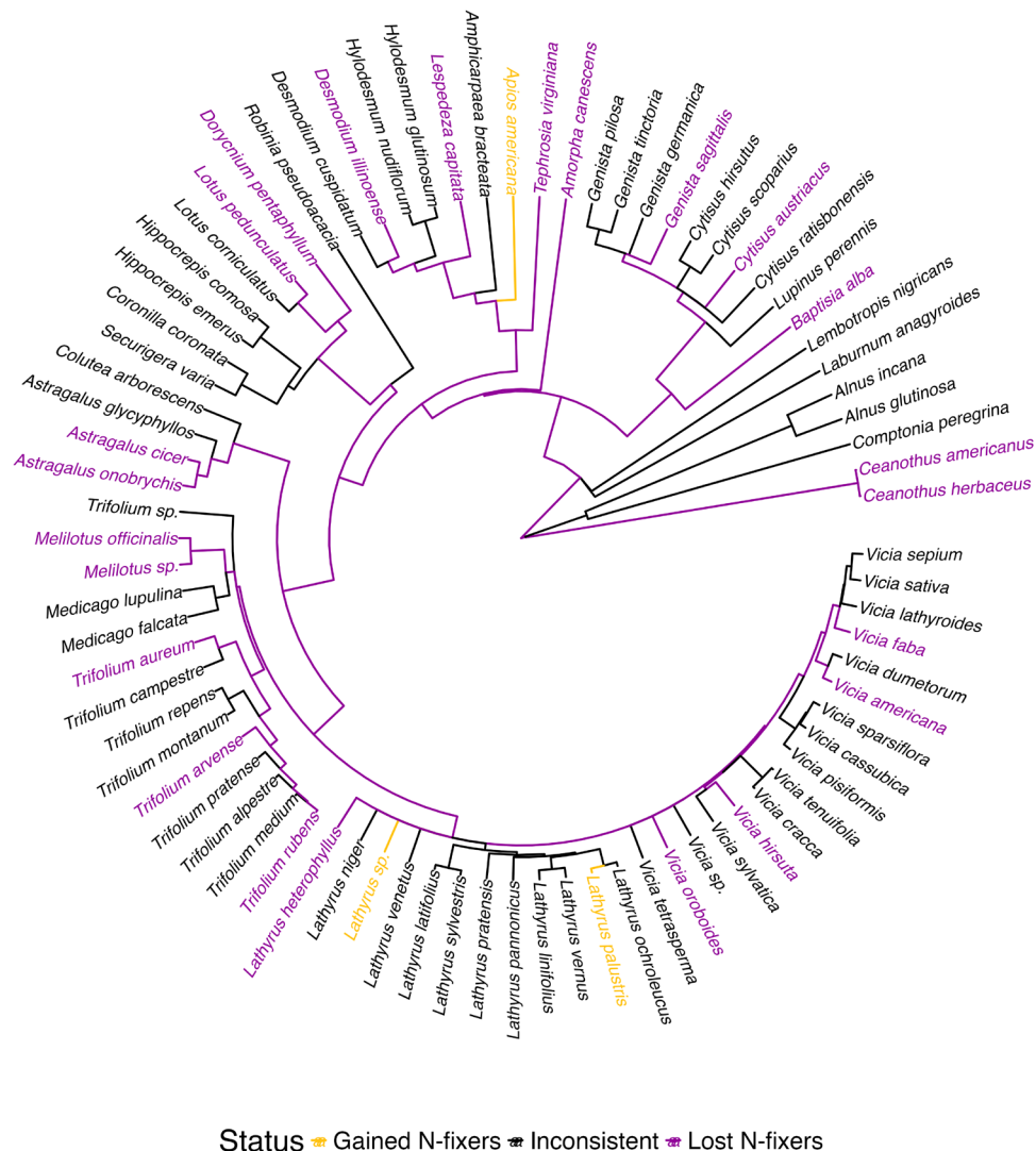
Fig. 3. Phylogenetic tree of N-fixer species in the study plots. Species could either appear in both surveys (“conserved,” none), exclusively in the baseline (“lost,” purple), and exclusively in the last resurvey (“gained,” yellow) or display different trends across sites (“inconsistent,” black).