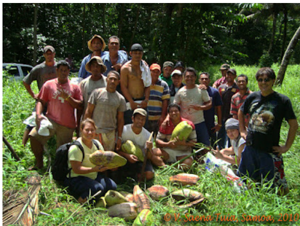
Collecting coconut varieties for conservation when Olomanu was the Samoan national coconut genebank

How to prepare leaflet samples for molecular analysis of coconut varieties.