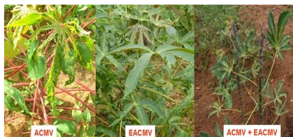
Fig. 1: Various symptoms caused by cassava mosaic Begomovirus disease in the different cassava production areas in Togo: Leaf curling symptom with yellowing caused by ACMV on a local cultivar Yovovi; Leaf curling symptom caused by EACMV on a selected cultivar “KH 1 04” and leaf curling symptom small leaves caused by ACMV in mixed infection with EACMV on a selected cultivar KH 1 04

Phylogenetic analysis: CP gene sequences were considered for this analysis due to their importance for Begomoviruses replication gene expression [14] . The phylogenetic tree was estimated using the neighbor-joining method [13] with the Unweighted Pair-Group Method with Arithmetic average (UPGMA) distance matrix (MegAlign program).