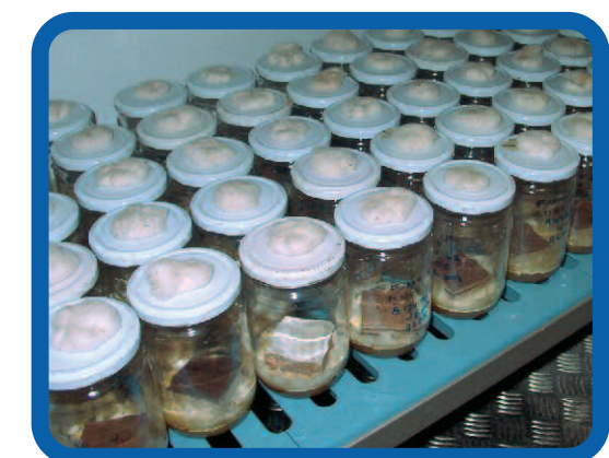
XP ENV 12038 tests