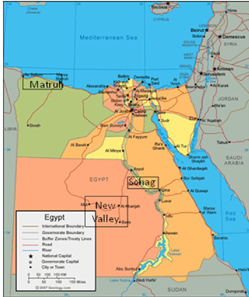
Figure 3. The three locations surveyed in Egypt.

sample was utilised based on two hierarchical criteria: (i) the location of the villages (their distance and access to the main city), and (ii) the flock size. With the agriculture land scarcity in the New Valley, landless farmers were also surveyed. Thirty farmers were surveyed in each agro-ecological zone.