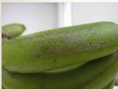
Silver rust thrips