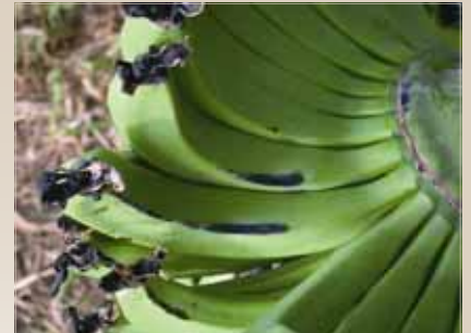
Scarring by a leaf