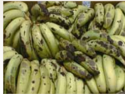
'Green ripe' fruits