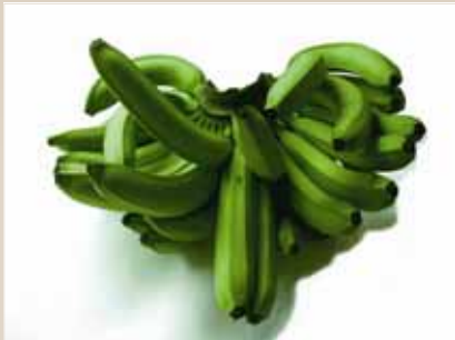
Double fruit and deformed fruit