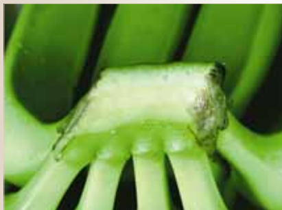
Crown cut too short