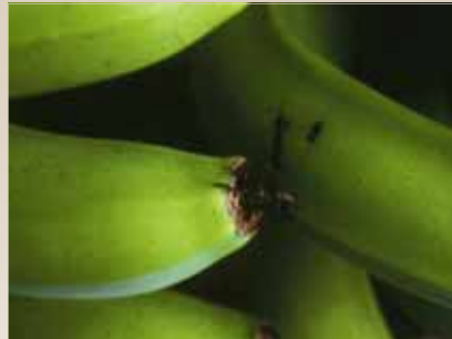
Scarring by a fruit tip