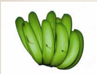
Scarring by guying cord