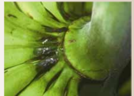
Flexed fruit stalks