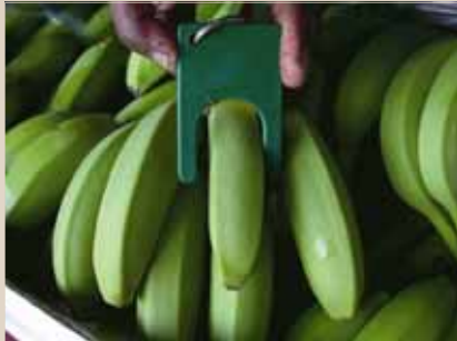
Fruit too thin