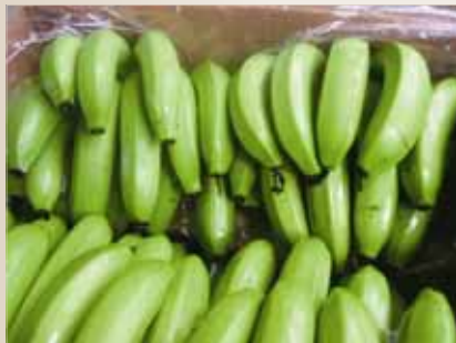
Incomplete flower removal