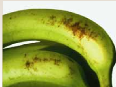
Red rust thrips