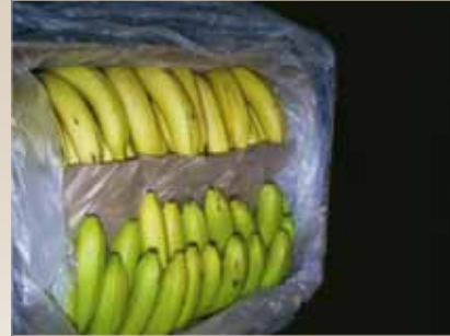
Unevenness after ripening