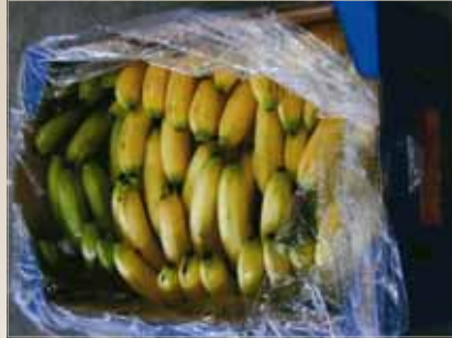
'Ship ripe' fruits