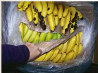
Latent anthracnose infection