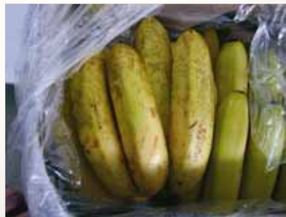
Red speckling at ripening