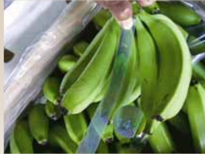
Fruit too short