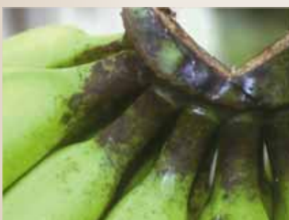
Sooty mould on fruit stalk