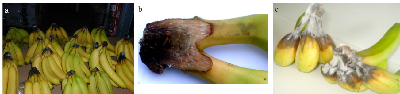
Figure 1. Banana crown rot — La pourriture de couronne des bananes .

a: necrosed fruit clusters — bouquets de fruits nécrosés ; b: internal necrosis — nécrose interne ; c: necrosis spread to peduncles and fingers — progression de la nécrose sur les pédoncules et les doigts .