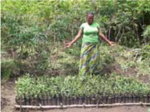
Photo 4 : Acacia auriculiformis nursery in one of the Project EU Makala villages