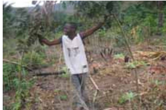
Photo 3 : Assisted Natural Regeneration applied by a farmer in a farm located on the Batéké Plateau (Province of Kinshasa, RDC)