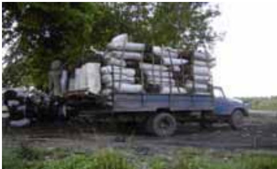
Photo 1 : Transportation of charcoal to Kinshasa (DRC)

The increase in the demand for wood energy in cities has exacerbated the pressure on forest resources in the region. This is of particular concern in view of the lack of incentives for the restoration or sustainable management of these resources. However, it ensures the livelihood of a large number of households. It was estimated that the total value of the wood energy market was worth 143 million dollars in 2010 (Schure J. et al. , 2011), 3.1 times the value of national roundwood exports of 46 million dollars in 2010 (FAO, 2011). Over 300,000 people are involved in this informal sector (Schure J. et al. , 2011), representing 20 times the number of persons (i.e. 15,000) working in the formal forest sector in the country (Eba'a Atyi R. and Bayol N., 2009). Most cash-generating opportunities exist at the level of production (the share of income generated varies from 47% for fuelwood harvesters to 75% for charcoal producers). Wood energy related incomes largely complete the average income of households. These incomes generated by wood energy contribute to their basic needs and provide households with an investment capital (mainly in agriculture and, to a lesser extent, in small-scale activities such as cattle rearing and fishing). Urban households rely heavily on woodfuel (87% in Kinshasa). Many businesses such as bakeries, breweries, restaurants, and brick and aluminum factories also rely on wood energy for their daily operations.