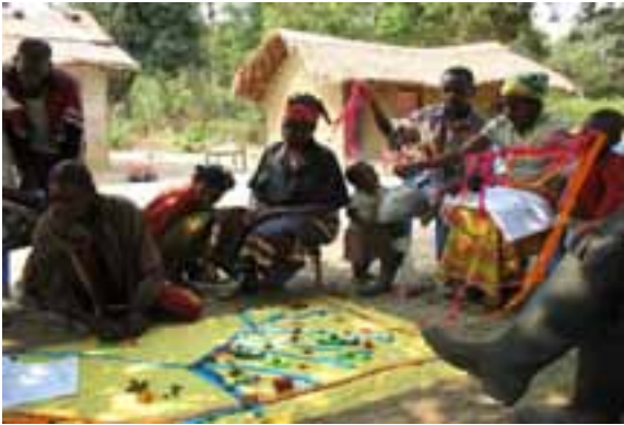
Photo 2 : Reproduction of Landscape Units using interactive models in the Kinduala village (Province of Bas Congo, DRC)