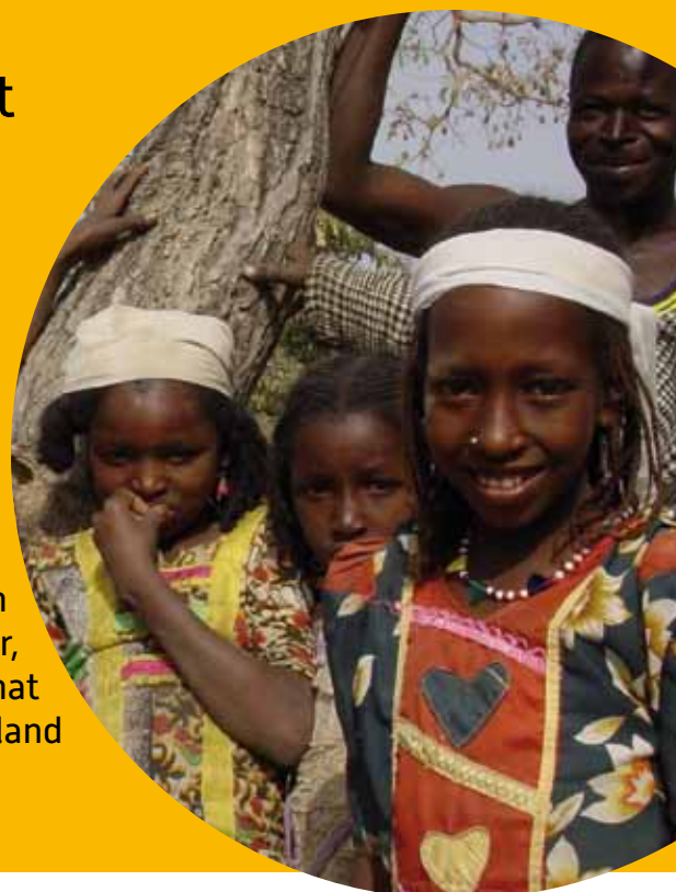
Fula shepherd children at the foot of a shea tree.

In the past, the natural vegetation of Sahelian landscapes comprised wooded grasslands on the slopes and various types of forest in the valleys. Nowadays, in every inhabited zone, most of the deep soils have been cleared and are now cultivated. Cohabitation between crop farmers and other users of these areas (particularly stock farmers), who often have conflicting interests, is sometimes fraught. However, through various projects, CIRAD researchers have shown that these groups can organize themselves and come up with land management solutions that optimize any possible synergies.