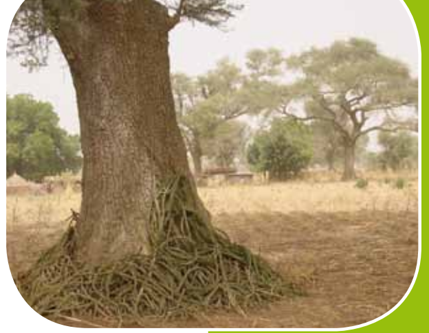
Faidherbia albida parks are a perfect example of a positive combination of animal and crop farming and wood production.

Certain areas are steadily being appropriated by woodcutters' organizations. This is the case in Niger and Mali, where CIRAD has supported the introduction of a local natural resource management policy and the creation of woodcutters' associations and rural fuelwood markets. Unfortunately, those groups sometimes have a tendency to exclude stock farmers, claiming that their animals damage trees, particularly stump sprouts. However, scientists have shown that livestock in fact has a very limited impact on tree survival and growth in the Sahel. On the contrary, grazing during the rainy season primarily concerns the herbaceous layer and in fact reduces dry season fire damage to trees. Lastly, stock farmers are objective allies of forest users in the fight against excessive clearing.