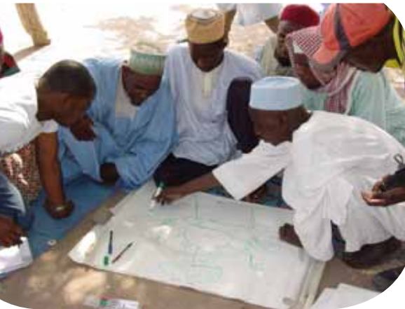
Discussion between stock and crop farmers concerning joint land management in a village in northern Cameroon.

Cohabitation between the different users of a given area, who often have conflicting short-term interests and customs, is not easily managed. Through various projects, researchers from CIRAD have shown that these groups can organize themselves, begin talks, come up with scenarios and find land management solutions that optimize any possible synergies. This involves creating and supervising negotiating platforms and conducting multi-stakeholder modelling. Generally speaking, taking account of the pastoral value of trees helps to ensure management methods that preserve biodiversity, and indeed biomass carbon stocks, more effectively, while providing local people with more diversified sources of income and helping to keep the peace between the different human groups concerned.