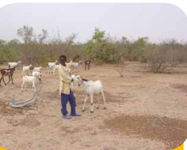
Young shepherd leading his herd through a forest area used for fuelwood production, in Niger.

Dunes, hills and dry plateaus, which are often stony and difficult to cultivate, serve as collective areas for grazing, hunting and gathering, particularly of wood. Copses and small areas of bottomland forest have in some cases been preserved around ponds and on riverbanks. The farmers, for their part, have almost all kept in their fields a few trees they see as useful and not too much of a problem for their crops.