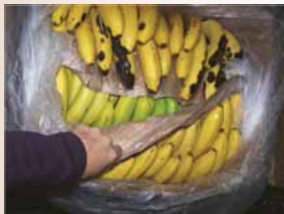
Latent anthracnose infection