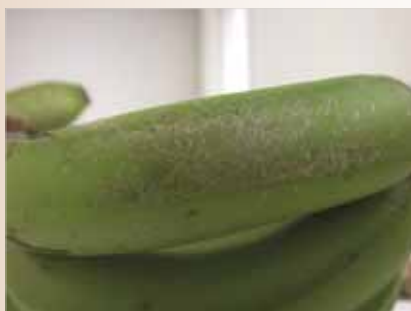
Silver rust thrips