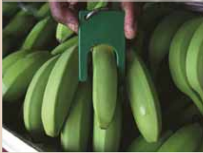
Fruit too thin