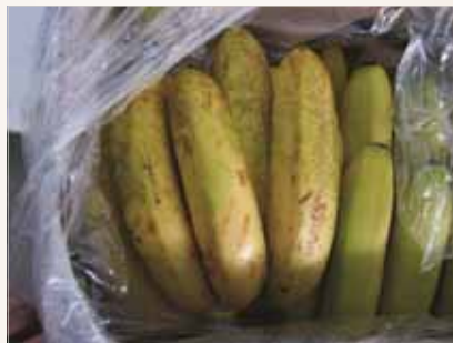
Red speckling at ripening