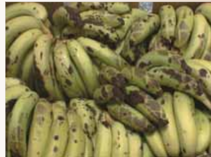
'Green ripe' fruits