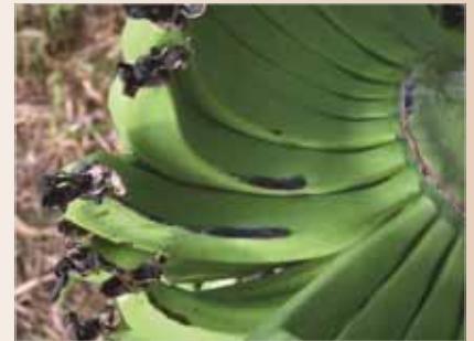
Scarring by a leaf