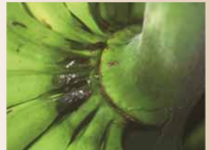
Flexed fruit stalks