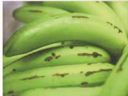
Damage by Diaprepes root weevil