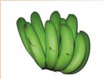
Scarring by guying cord