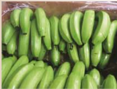
Incomplete flower removal