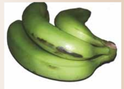
Bruising caused by impact during packing