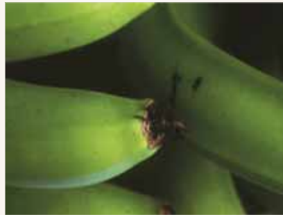
Scarring by a fruit tip