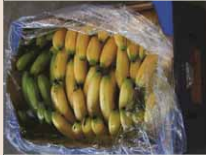
'Ship ripe' fruits