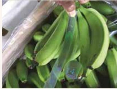
Fruit too short