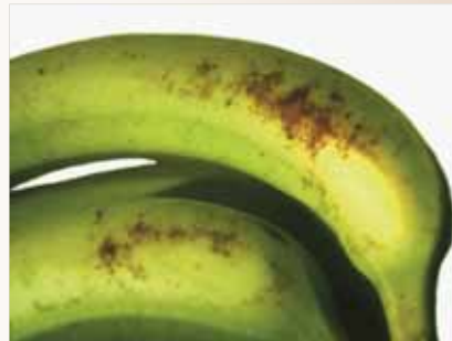
Red rust thrips