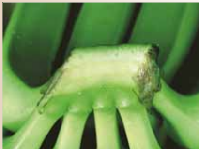
Crown cut too short