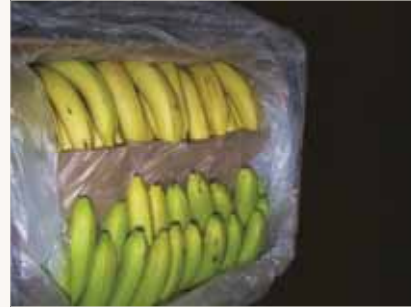
Unevenness after ripening