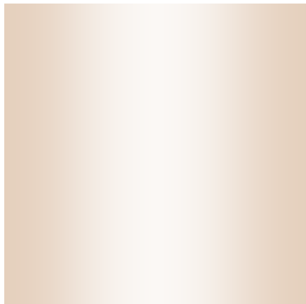
Banana streak disease