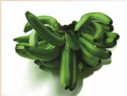
Double fruit and deformed fruit