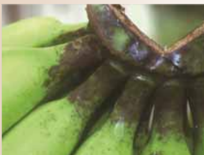
Sooty mould on fruit stalk