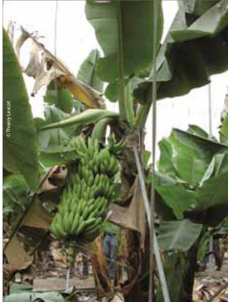
Panama disease on Petite Naine