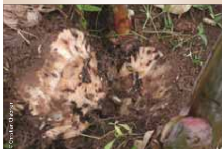
Banana borer on a corm