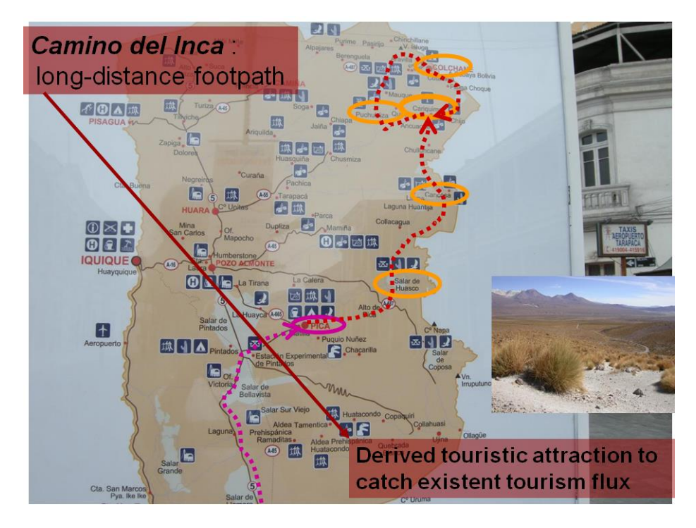
Figure 1: Tourism's experience in the chilean highlands