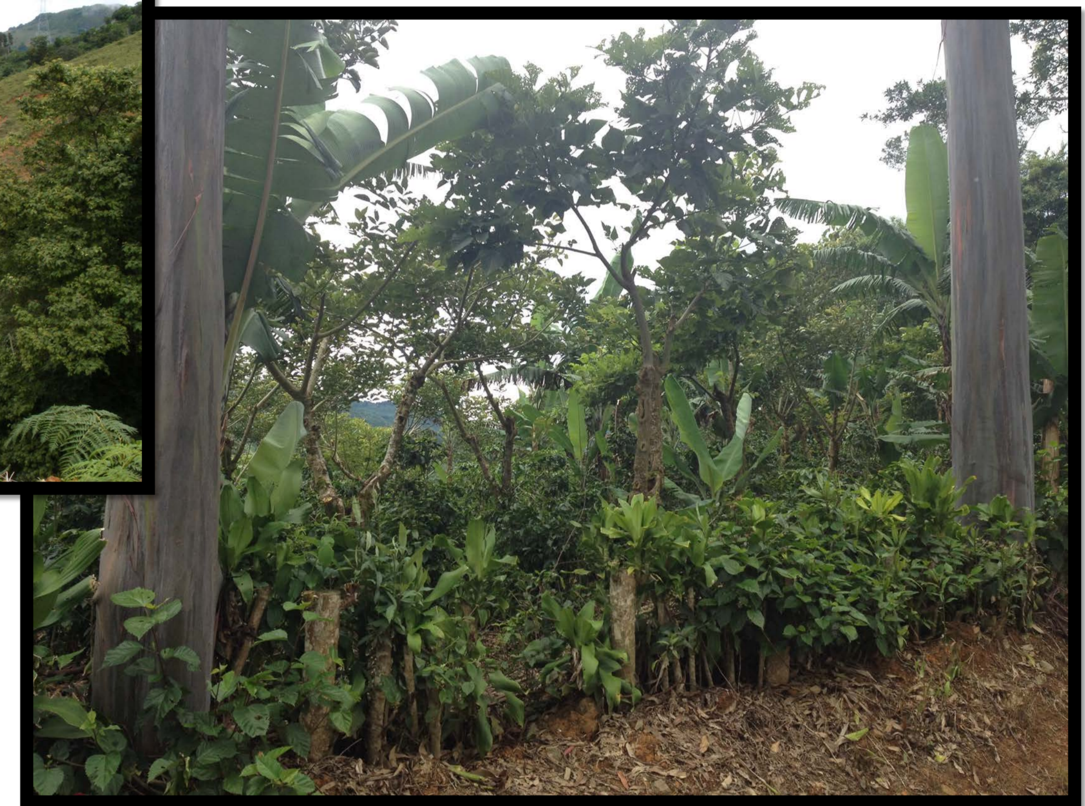
Figure 3: Certification encourages the use of soil protection practices such as shade trees, live barriers and the minimization of herbicides.