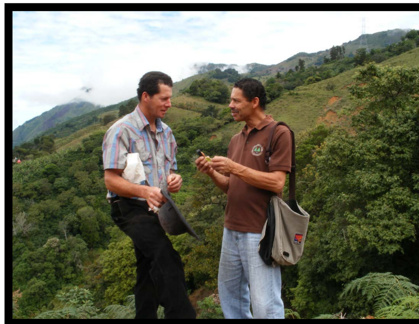
Figure 1: Certified farmers receive more farm visits than uncertified farmers. This allows the agronomists to start an individual discourse about sustainability.

How do sustainable coffee certifications help cooperatives leverage sustainable farming practices among their members?