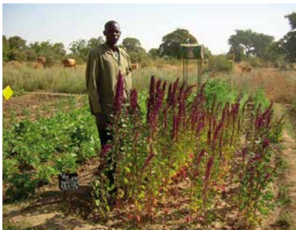
Figure 2. Quinoa plants (traditional variety 'Roja Tastina') near the time of harvest at the IPR/IFRA experimental station in Katibougou, Mali, in February 2008 (dry season). The water tanks that can be seen in the background provide gravity-fed irrigation.

The Chilean and Argentinian varieties of quinoa (Table 1) were sown in experimental plots of 18 m 2 on 15 November 2007, which corresponds to the dry season. Five or six seeds were sown in pockets spaced at two different densities (every 10 and 20 cm) with 50 cm between the rows, except for the Argentinian varieties, for which less material was available. These varieties were sown at the higher density only (every 10 cm). Irrigation was spaced at 15-day intervals (3/4 of field capacity) and every 10 days after flowering. The only fertilizer used was compost from cattle manure (at a rate of 8 tonnes/ha). In the second period of assessment in the dry season (2008/09), seeds from plants that produced panicles and grains in 2008 were used (Figure 2). This time, seeds were sown slightly later (5 and 15 December 2008) in the same conditions as for the first period, using seeds obtained from the harvest in the first assessment. The germination capacity was assessed for the seeds from the first harvest. Not all results were viable (see results section).