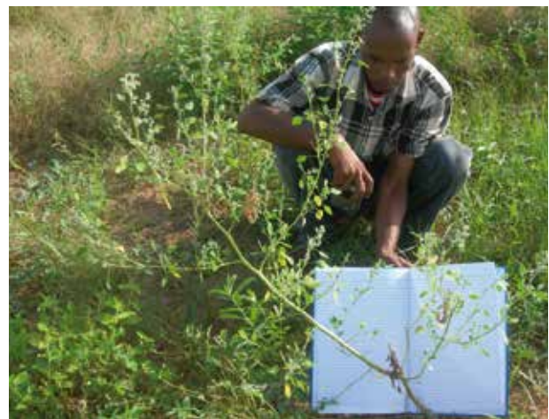
Figure 3. Plant from the variety 'BO78' during the rainy season in 2008, with fungal damage (unidentified) on the panicle that caused the entire apical panicle to abort and the plant to become bushy (many branches).

The quinoa seeds that arrived in Mali for the first time were assessed for their capacity to germinate at successive stages, involving quality assessment in storage conditions at ambient temperature. Temperatures ranged between 21°C and 26°C, with extremes (outside ambient temperature) of 45°C in the dry season and maximum inside ambient temperatures around 10°C less. Maximum ambient humidity was quite high in all periods (> 50%), therefore the seed weight was assessed before and after 3 months of storage. Once the first seeds were produced in Mali, germination was assessed following 12 hours in damp cotton under laboratory