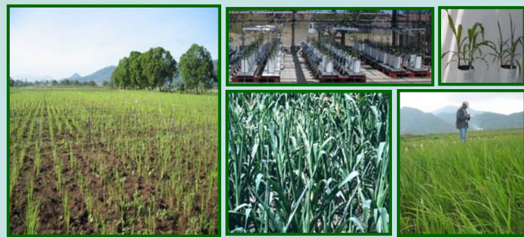
Rice and maize under experimental conditions