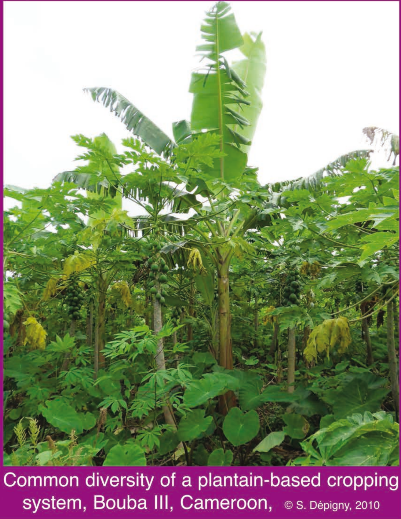
Common diversity of a plantain-based cropping system, Bouba III, Cameroon, © S. Dépigny, 2010

T RADITIONAL plantain-based cropping systems are generally mixed: both perennial and annual crops are commonly associated with plantain. Agroecology promotes agrosystem diversity: plant associations enhance biological processes, provide agrosystem services such as biological regulation of pests and diseases or fertility restoration, and help reduce chemical inputs. Designing innovative and sustainable plantain-based cropping systems require scientific and technical knowledge concerning the effects of commonly associated crops on plantain crop. What agrosystem services do crops commonly associated with plantain provide?