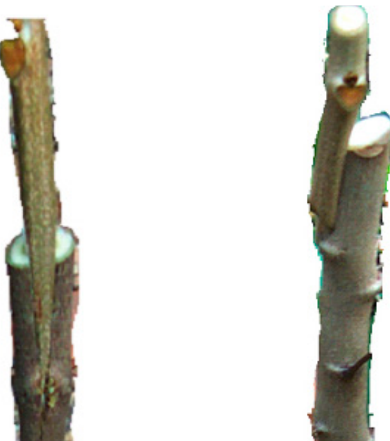
Figure 4. Cleft grafting (left) and bark grafting (right) used for litchi propagation.