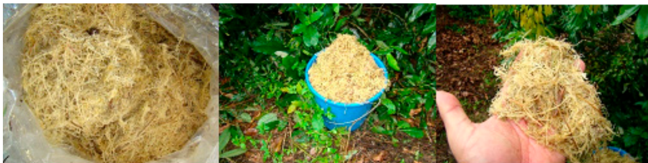
Figure 3. Rooting media for air layering.