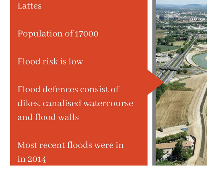
Fig. 3 Aerial view of Lattes and flood risk management infrastructure

farmers whose houses were located on elevated locations and for whom the autumn floods were manageable events (Durand 2014). Sommières, a town built partly on the riverbed, has a long history of flooding and residents and authorities had developed adaptive strategies to deal with autumnal floods, such as monitoring the upper watershed, warning systems, rapid transfer of belongings to the upper floors.