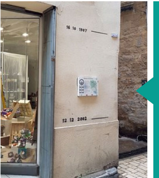
Fig. 4 Signage on wall in central Sommières marking previous flood levels

Sommieres Population of 5000 Flood risk is high Flood defences consist of retention dams upstream, alarm systems and household scale adaptation e.g.main living space located on the first floor River floods annually