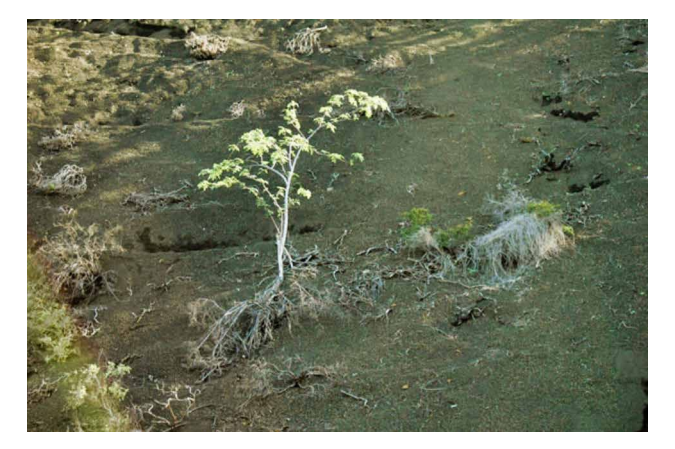
Restoration and adaptation strategies will increasingly come across novel ecosystems that enclose unknowns of their own (photograph: tree in the Galapagos Islands in Ecuador)

uses according to political and economic considerations and vested interests without considering local communities. However, governments and legislatures are the major agents that can incentivize land rights, tenure and access through policy reforms and legislation. Major challenges remain about how to balance top-down with bottom-up governance and how to resolve issues of tenure and access.