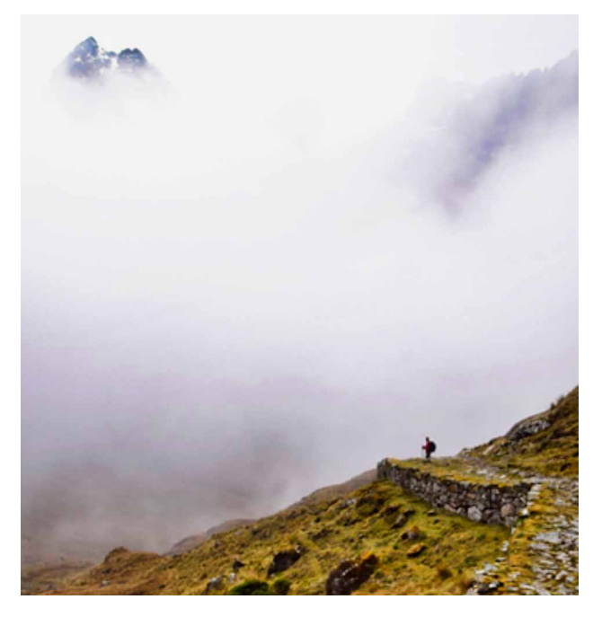
Adaptation to climate change requires navigating pathways toward unknown futures (photograph: trail in the Vilcabamba mountain range in the Peruvian Andes)

In these examples, new knowledge creates benefits for multiple stakeholders: mangrove restoration in Vietnam is desirable because it provides clear economic benefits