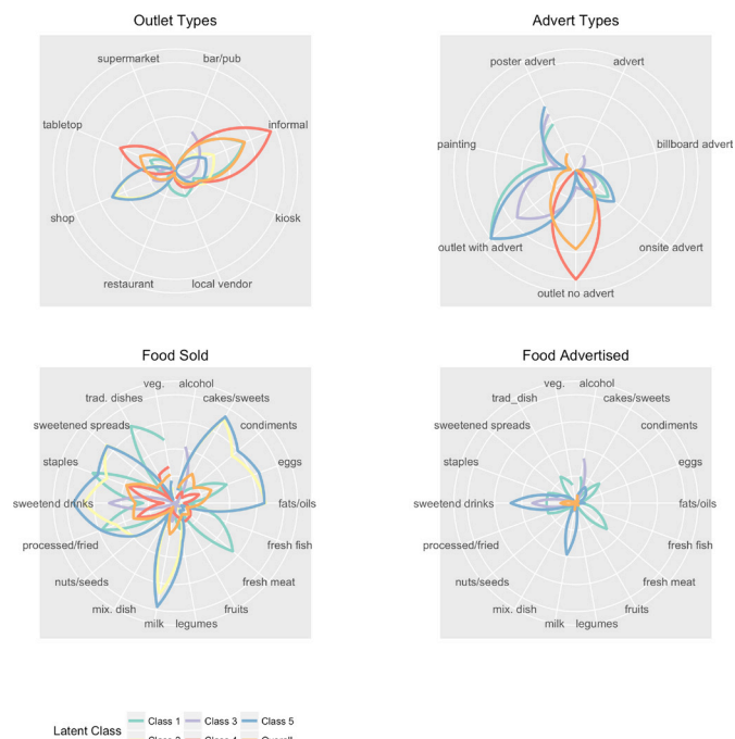
Figure 1 Conditional response probabilities of the latent class model.