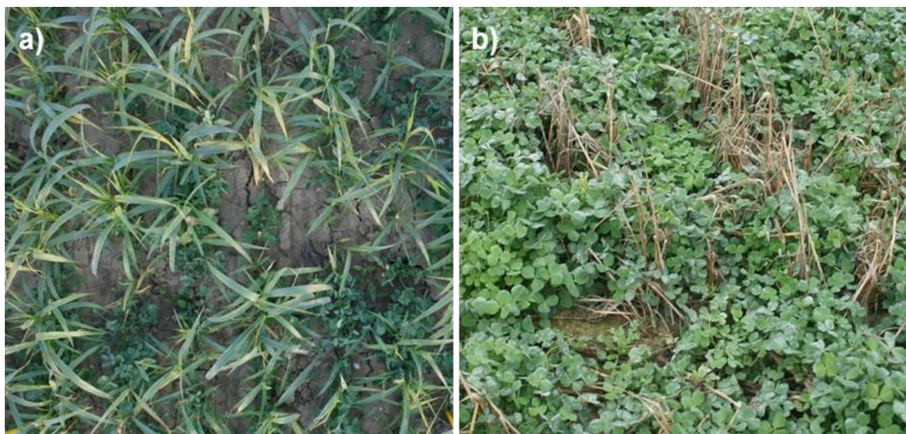
Figure 2: Example of the evolution of the moha-clover mixture to provide "relay" ecosystem services through early moha development and then maintenance of winter cover with frost-resistant clover. Photographs taken: a) 4 th October 2012 and b) 8 th January 2013.

In the case of a long fallow period with termination at the beginning of spring , it is desirable to provide both nitrogen management services while maintaining a vegetative soil cover to avoid soil erosion or structure degradation. In this case, species must be resistant to winter conditions (low senescence and/or good frost tolerance), i.e. a mixture of ryegrass-red clover can be chosen. One may also want to have a succession of these N services thanks to a temporal complementarity for access to resources, starting with an efficient "nitrate catching" effect at the beginning of the cycle followed by a "green manuring" effect in a second stage. In this case, a mixture associating a non-legume plant with early development in autumn can be sown to enhance the nitrate catching very early