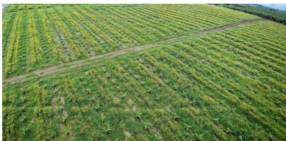
▲ A banana-Crotalaria association.