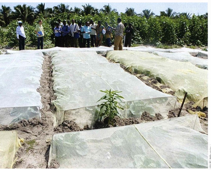
▲ M. Tonou, a horticulture farmer at Ouidha, Benin, explaining to his colleagues how to use anti-insect netting to protect cabbage crops.

In tropical regions, vegetable crops are infested year-round by a broad range of pests. Farmers generally deal with this problem by spraying pesticides. Although farmers, through such unplanned and uncontrolled chemical treatments, may sometimes be able to turn a profit, the residues remaining on the vegetables are a threat to consumer health, and there is a high groundwater pollution risk. It is now crucial to develop alternative pest management methods that are less dependent on chemical inputs. In Benin, the mosquito netting principle was adapted for the protection of cabbage crops—plastic netting placed over the crop late in the day thus kept pests (mainly nocturnal) from reaching the plants to feed and lay their eggs.