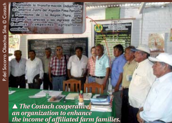
▲ The Costach cooperative, an organization to enhance the income of affiliated farm families.

Under the Empowering Smallholder Farmers In Markets (ESFIM) programme, European research agencies (CIRAD, Wageningen University, Natural Resources Institute) are conducting studies in 11 countries in collaboration with market-oriented farmers' organizations. Family farming changes and innovations should be thought out and managed collectively. Cooperatives have a pivotal role in local dynamics as a means of collective action.