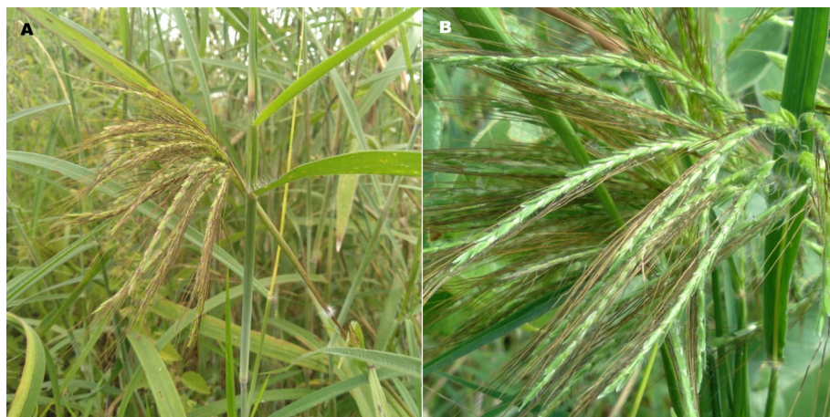
Fig 1. Euclasta condylotricha Steud harvested in Benin. A: The whole plant with stem, leaves and flowers. B: Areal part of the plant showing the flowers.

https://doi.org/10.1371/journal.pone.0278834.g001