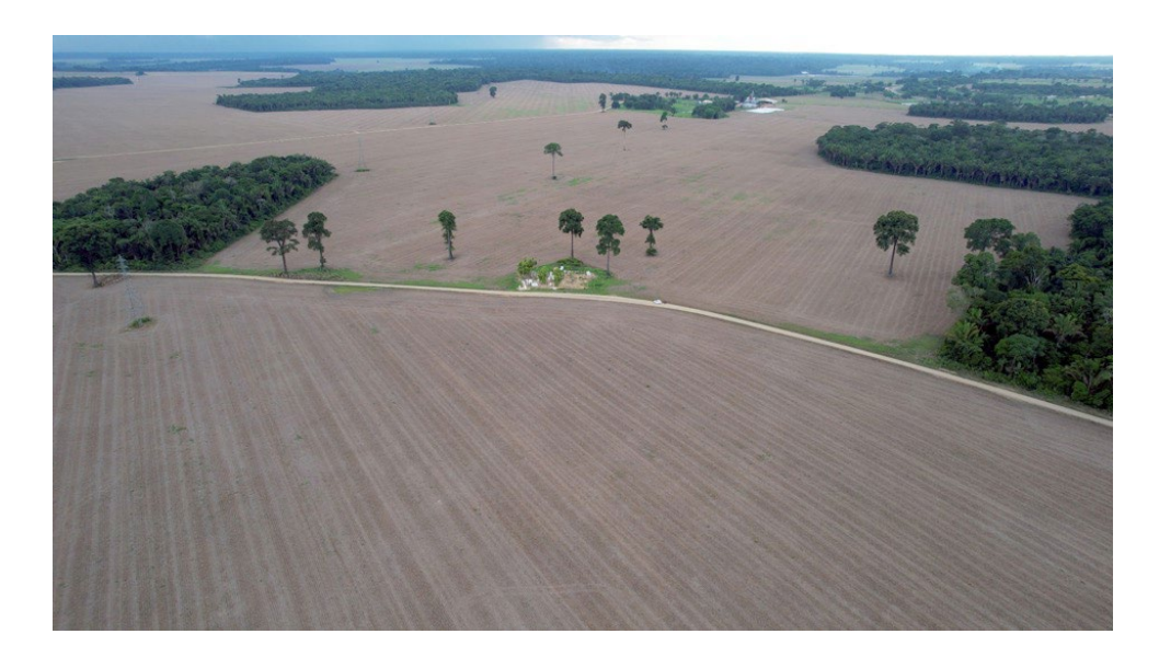
Figure 2 | Cemetery in the middle of the soybean fields in Belterra, illustrating the extinction of rural communities