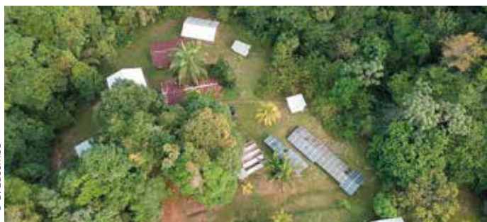
Paracou forestry system, French Guiana

The goal of the ALT project is to improve the parameters of vegetation models for the tropical forests of French Guiana in order to build knowledge about forest regeneration potential and the dynamics of the canopy, by combining inventory and remote sensing observations. The key question is whether these forests will be resilient to climate disturbances.