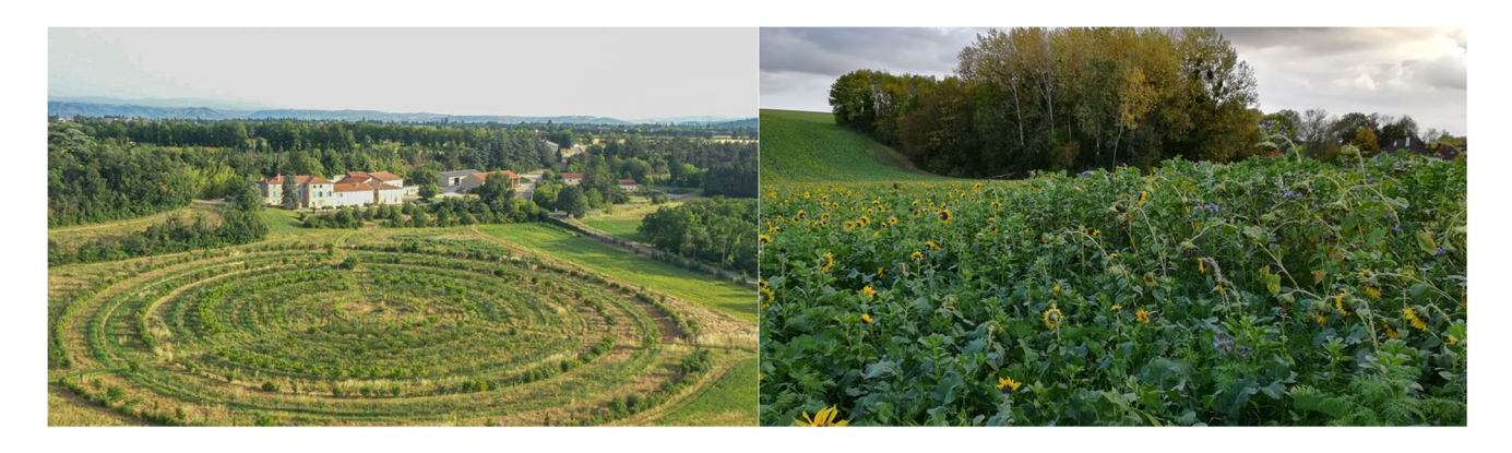
Fig. 1 Agroecological landscapes with (left) several fruit tree species combined in a circular orchard and (right) a mixture of species in a cover crop at the edge of a wood.