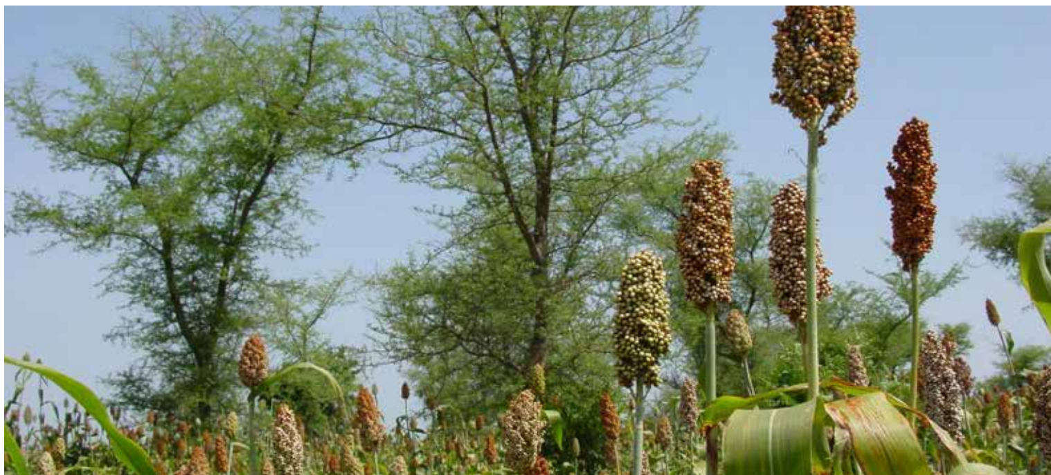
Sorghum just before harvest, in a faidherbia parkland at the end of the rainy season (October) on the Fadaré Dune, Far North Region, Cameroon; the faidherbia trees have just regained their foliage, but the shade will not reduce the upcoming harvest. On these poor sandy soils, but well supplied with deep water, only millet can be grown in treeless plots, while sorghum, which is more demanding in terms of fertility, can grow only under the trees.

Similarly, in a recent updated review of the sustainability of Faidherbia albida -based agroforestry in sub-Saharan Africa, Sileshi et al. (2020) showed that maize and sorghum productivity increased by 150% and 73% respectively under the faidherbia canopy compared with the canopy-free zone.