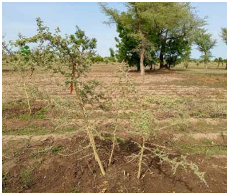
Left: At the end of the dry season, a clump of Faidherbia albida . Right: The same clump after the farmer selected four shoots; the following year he will keep only two shoots, then one in year 3.

Faidherbia albida , formerly known as Acacia albida , is a member of the legume family. It is one of the most suitable and the most recommended tree species for FMNR in areas that are favourable for it, in particular, those with sandy alluvial soils and a shallow water table in the dry season (10–50 m). Where it is not naturally present, planting it is possible, but is much more expensive: at least XAF 1,000 (Central African franc; EUR 1.50) per tree planted instead of XAF 100 per tree (EUR 0.15) protected by FMNR.