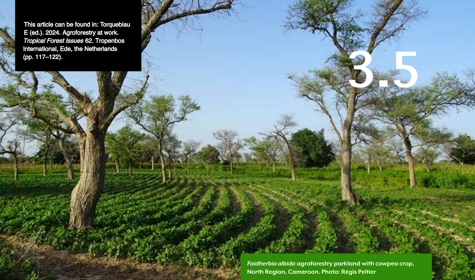
Faidherbia albida agroforestry parkland with cowpea crop, North Region, Cameroon.