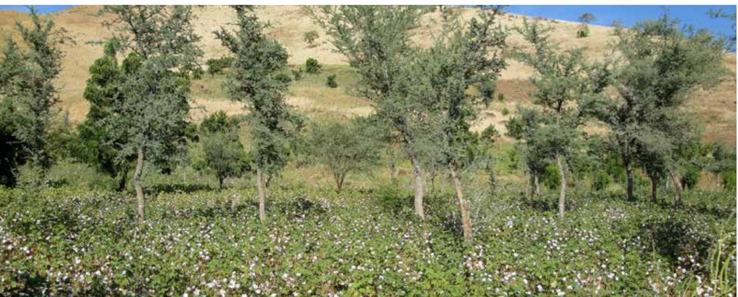
Cotton growing in a faidherbia parkland.

development and a higher average cotton weight were observed. In old parklands with very large trees, however, shade can become a limiting factor in cotton production. Even though faidherbia has an inverted phenology (leafing out in the dry season and defoliating in the rainy season), all the branches intercept some of the sunlight. It is therefore recommended that large crowns be pruned and old trees replaced by young seedlings selected by FMNR.