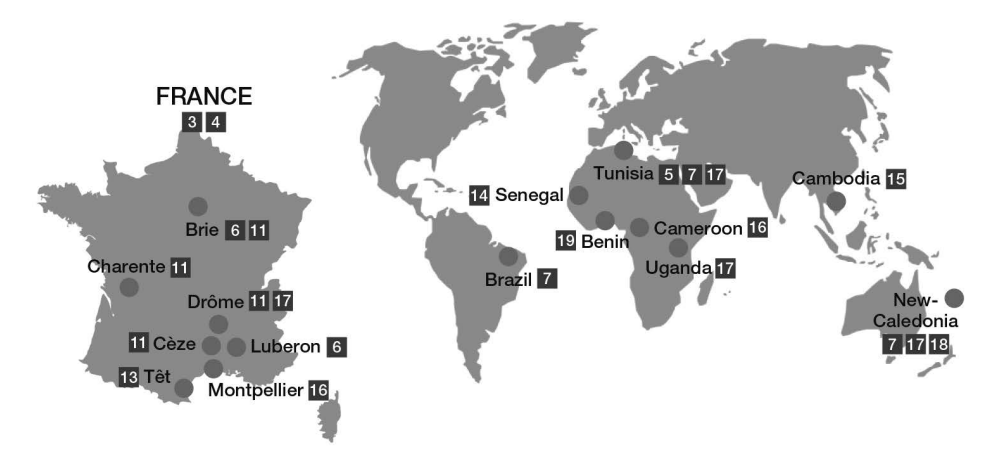
Figure 0.1. Localisation of the cases included in the book. The numbers in the black boxes correspond to the chapters dealing with the cases.

The editors of this book have sought to apply the principles they advocate: participatory, inclusive, transparent and open writing. The book was co-written by 50 researchers and 29 practitioners (decision-makers, politicians, associative actors, territory managers, etc.). It brings together authors and examples from different parts of the world (Figure 0.1). Most of the chapters were written by interdisciplinary teams (management sciences, modelling, agronomy, geography, sociology, economics, etc.) or a-disciplinary teams. The publication is open access which was a sine qua non condition in our choice of publisher. Even the choice of the title (in French) was discussed with all the authors!