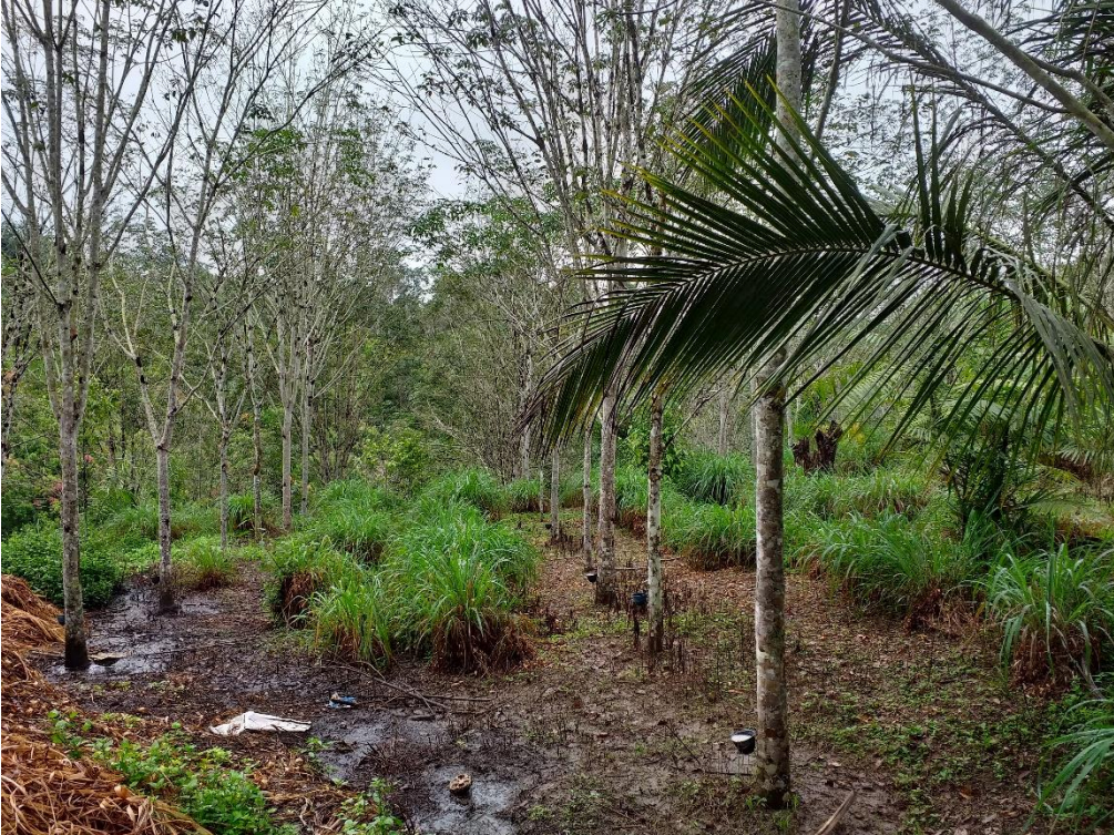
Photo 18. Rubber and sugar palm, Sipirok, North Sumatra, Indonesia, 2023