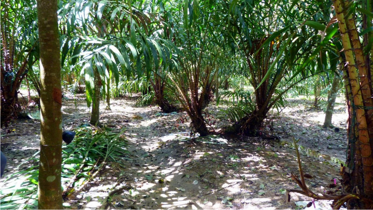
Photo 12. Rubber and Pak Liang ( Gnetum spp) in Phatthalung, Thailand, 2016