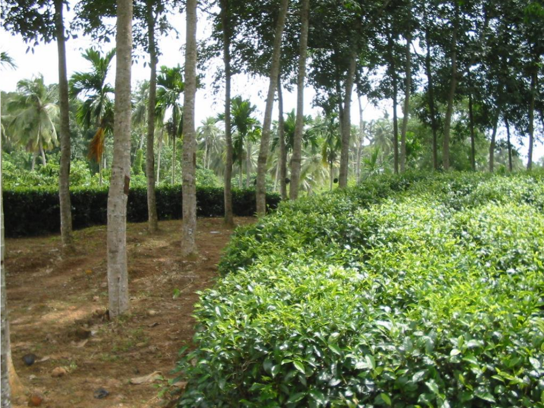
Photo 14. Intercropping with rubber, Central Vietnam, 2000