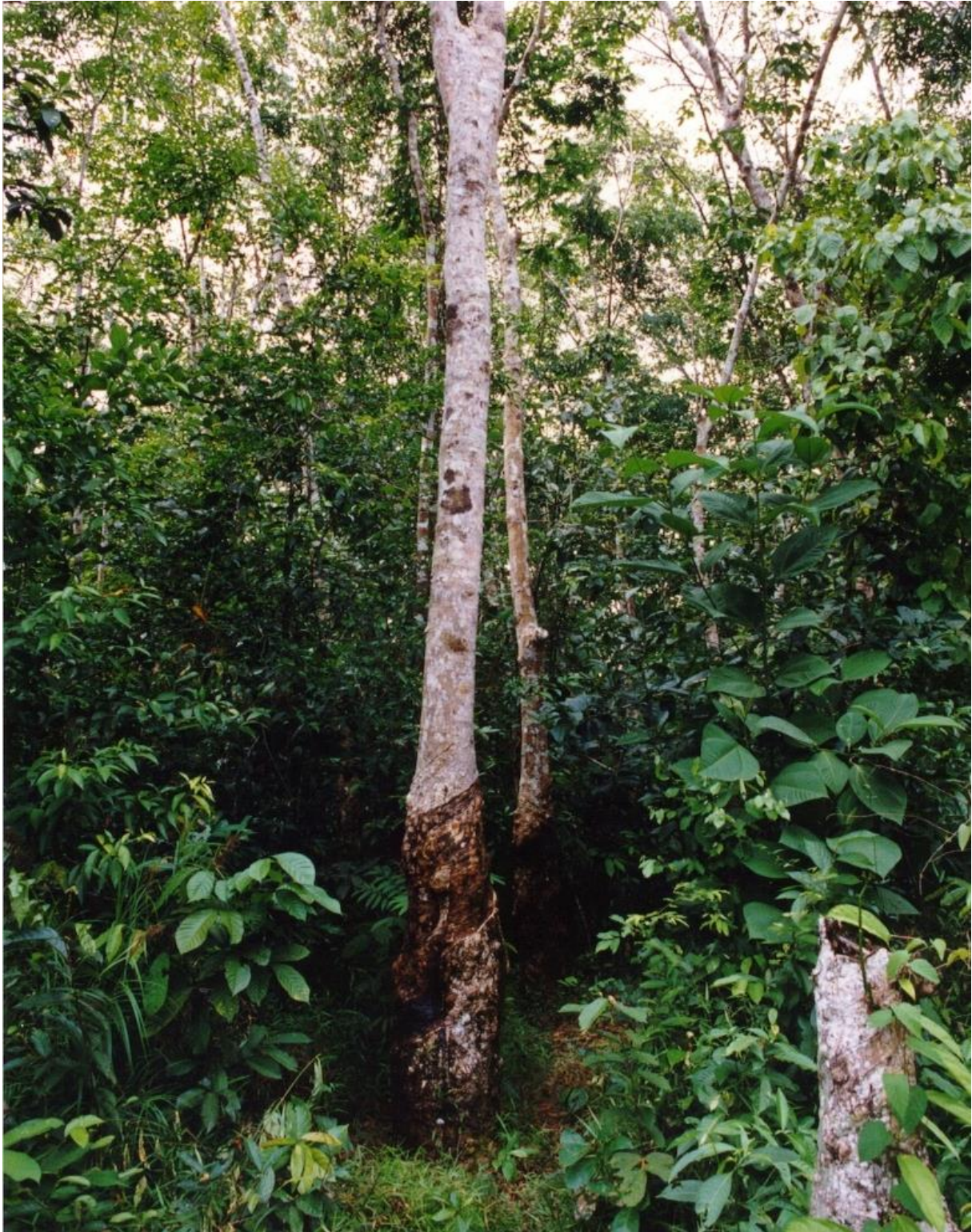
Photo 1. Jungle rubber in West Kalimantan, Indonesia, 1995