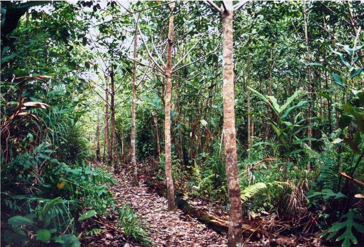
Photo 4. RAS 1 trial plot in West Kalimantan, Indonesia, 2019