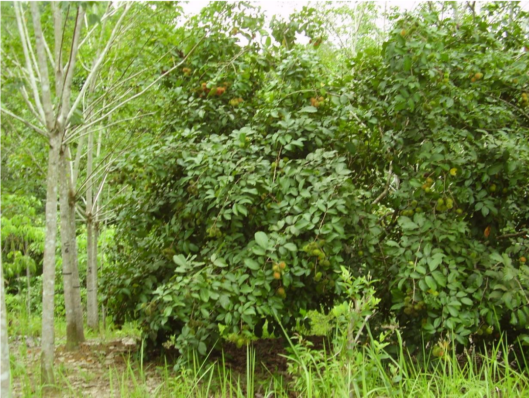
Photo 20. Rubber and teak, South Sumatra, Indonesia, 2007