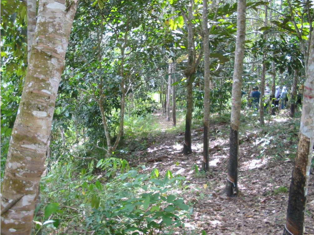
Photo 6. RAS 2 with upland rice intercropping in Sintang, West Kalimantan, Indonesia, 1997