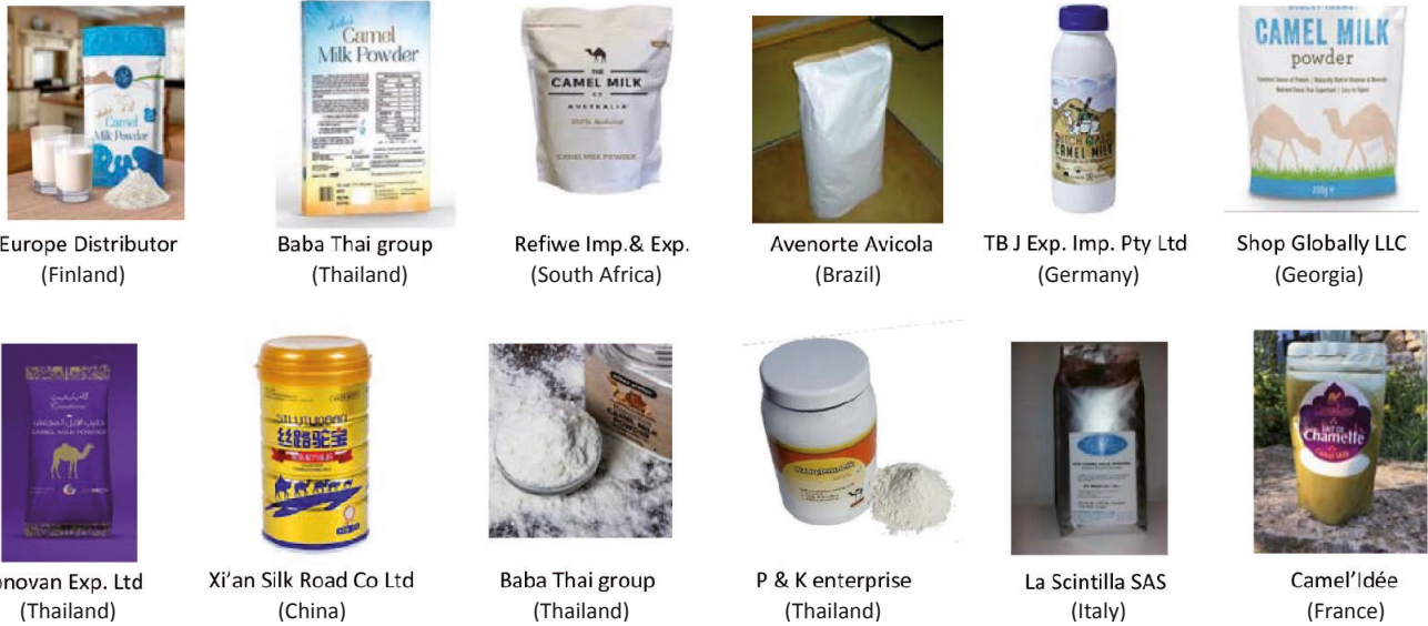
Figure 3: A few packages of camel milk powder and suppliers' names on Ali-Baba online sales site (China) /// Quelques emballages de lait en poudre de chamelle et nom des fournisseurs sur le site de vente en ligne Ali-Baba (Chine)

website www.oasismilk.com/fr/camel-milk-powder-and-capsules/ (Table IV).