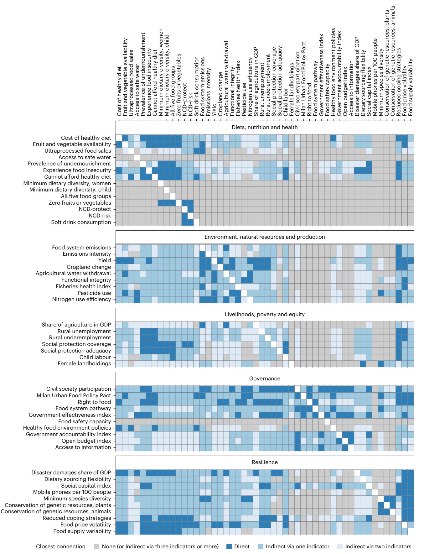
Fig. 3 | Closest assessed connection between each pair of indicators. The proposed causal relationships between pairs of indicators as assessed by expert assessment, directed from row to column. The darkest cells show a direct causal relationship. The medium blue cells reflect an indirect relationship via one

connecting indicator, and the lightest blue cells are indirect via two connecting indicators. The grey cells indicate an indirect relationship could exist via more than two indicators, or there may be no relationship. The identity cells are white. Network data underlying the figure are provided in Supplementary Table 5.