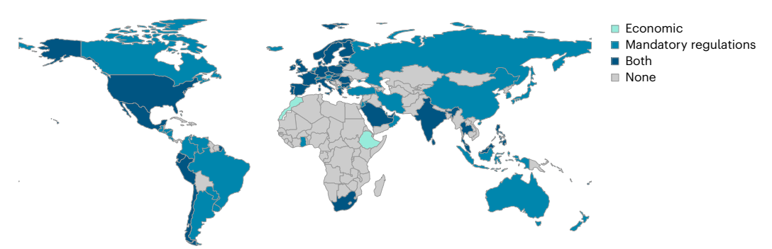
Fig. 2 | Health-related food environment policies. The presence of national health-related food environment policies classified into economic (taxes and subsidies) and mandatory regulatory (for example, front-of-pack labelling), both

or none. The countries in grey have no national health-related food environment policies (see Supplementary Table 6 for further information on the classification of policies to construct this indicator).