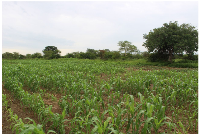
Fig. 1 Sorghum field in Plateau-Central region of Burkina Faso (Timothée Cheriére, 2022).

Crop models are particularly valuable for understanding how cropping systems perform across diverse environments and under various management practices (e.g., Queyrel et al. 2023; Blanc et al. 2024). They are built around generic scientific knowledge. The user can define the environment and the management practices under which the crop grows—offering an opportunity to bridge the gap between generic and context-specific farmer knowledge. Also, crop models can help quantify processes (e.g., N losses) that are tedious to measure (e.g., Thorburn et al. 2011; Blanc et al. 2024). Finally, and despite the time required for parametrization, their flexibility and relatively low cost of operation enable the simulation of a great number of situations that would be difficult to obtain with field experiments. Crop models have been used in participatory research following various protocols, simulating cropping system prototypes that were co-designed beforehand to assess their performance (e.g., Queyrel et al. 2023; Blanc et al. 2024), or directly engaging farmers with the models, simulating real farmer contexts for experiential learning (e.g., Carberry et al. 2004; Thorburn et al. 2011). Regardless of the approach, researchers had to